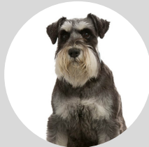
Monty. Office Dog E: info@whittleknight.co.nz M: 03 348 4149